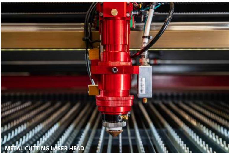
METAL CUTTING LASER HEAD